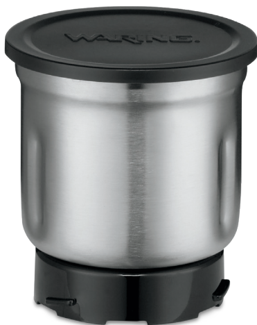
CAC103 Stainless Steel Bowl with Lid