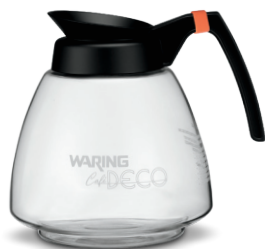
WADB64 64-oz. Glass Decanter